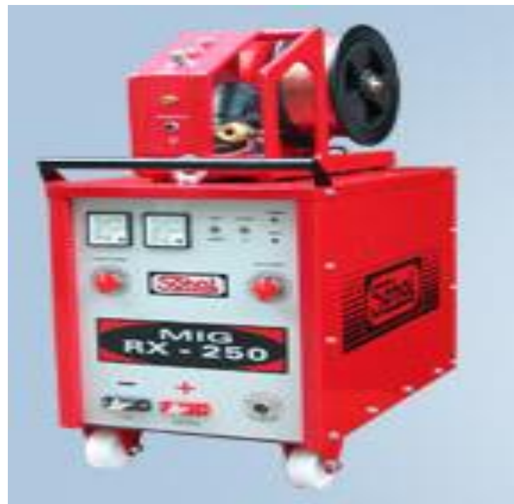
Fig-1: SOHAL RX250 MIG welding machine/india