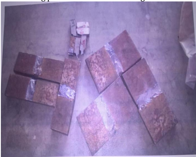
Fig-2: work piece material 50X50X10mmPLATE

Plate SA387 Grade 91(50x50x10mm) is taken for MIG welding process shown in below figure.