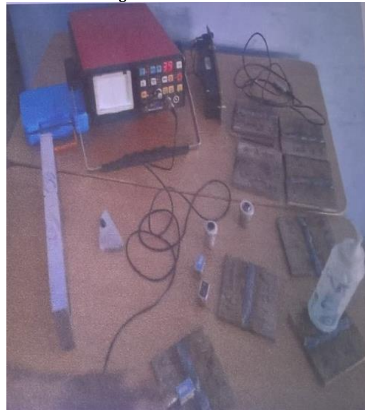
Fig-3:Ultrasonic testing machine