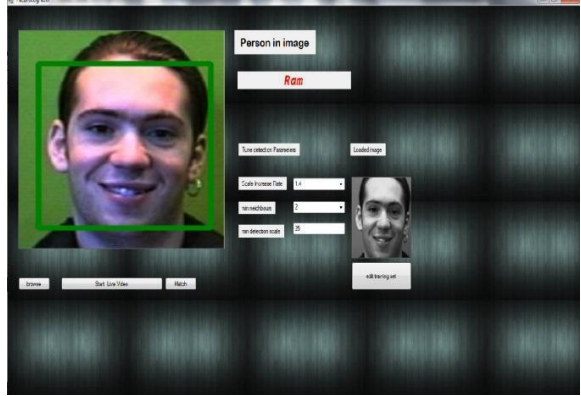
Fig. Face Recognition with Image