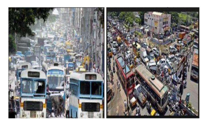
Fig 1. Traffic in urban cities [1]