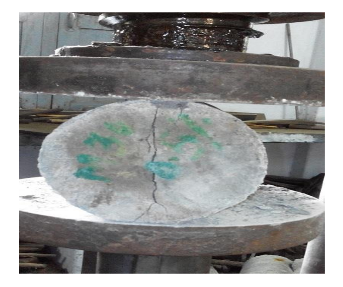
Crack Behavior of Specimen After Application of tensile load for 28 days