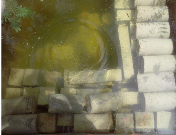
Specimens under Curing Process