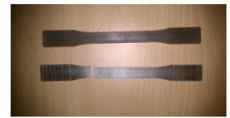
75% PP + 25% GF