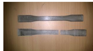
Fig-1; 50% PP + 50% GF

The Figure1 and 2 shows composites specimens prepared at different filler content.