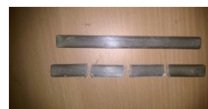
Fig-2; 50% PP + 50% GF