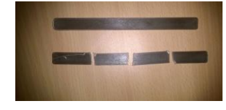
75% PP + 25% GF