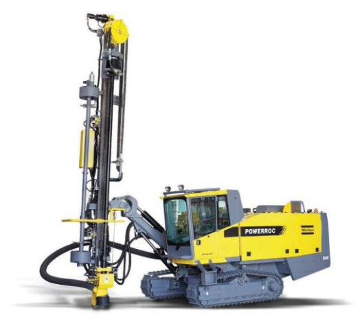
Fig.1 : PowerROC D40