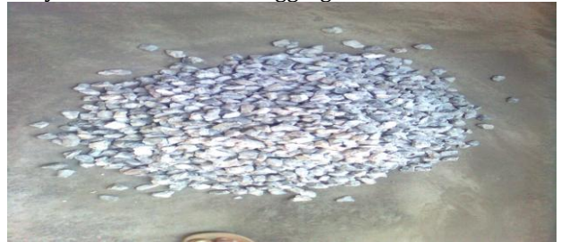
Figure no. 1.5 Recycled Aggregate.

Recycled aggregate is generally produced by two stages crushing of demolished concrete, screening and removal of contaminants such as reinforcement, wood, plastic etc. Concrete made with such aggregates is called as Recycled aggregate Concrete.