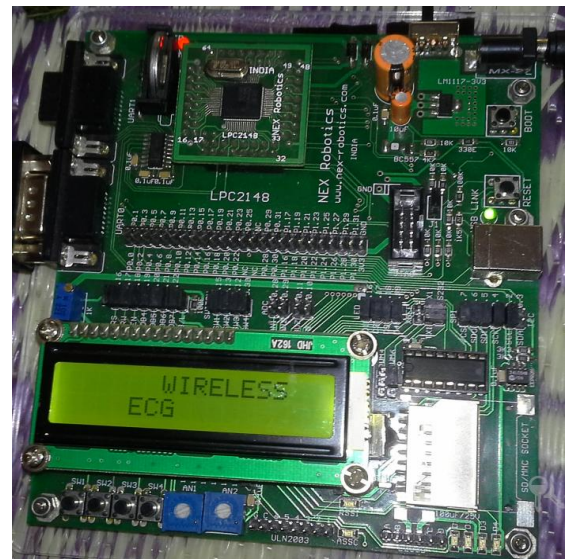
Figure 3. ARM7

ARM 7 bus width is 32 bit and it reduces the power consumption. ECG signal are processed by the processor. The signal is applied to ADC0 for the filtrations. The output of ADC0 is a 10 bit data. The ARM is a general purpose 32 bit microcontroller high performance and very low power consumption. The ARM architecture is based on Reduced Instruction Set Computer (RISC) principles, The ARM is a general purpose 32 bit microcontroller high performance and very low power consumption. The ARM architecture is based on Reduced Instruction Set Computer (RISC) Principles.