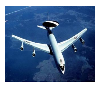
Figure 3. fused image