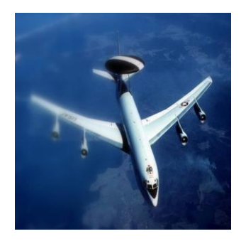
Figure 2 .image2