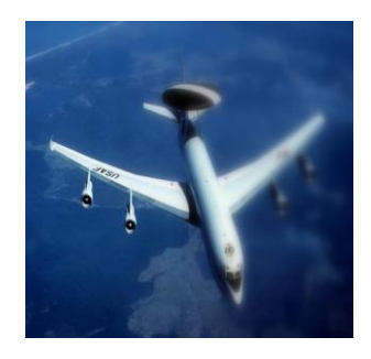
Figure 1.image 1

Image fusion is referred to as the process of obtaining a superior image from the input images by extracting certain features of the input images. Basic objective of fusion is obtaining more informative and better quality image than the input images.