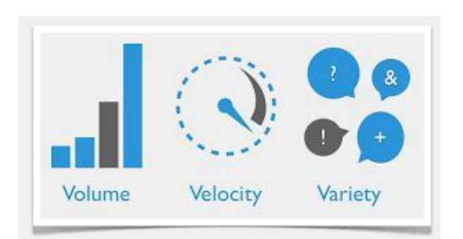
Fig-2.2: Representation of Big Data