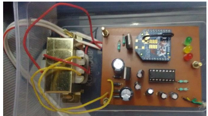
Fig 2 : Receiver

This module includes some subcomponents such as: RFID module(receiver) which is used to receive data from Zigbee RFID transmitter at bus to receiver at server side.