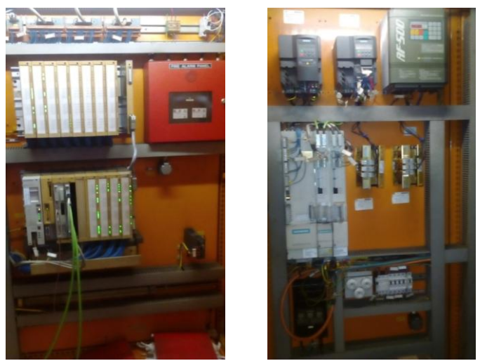
Fig-3: Electrical Control panel of Top Surface Grinding Machine

Fig-3 and Fig-4 shows the electrical control panel and HMI of the system respectively.