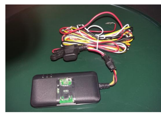
Fig -1: GPS device