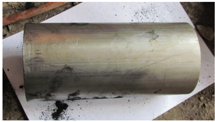
Fig 3:- Outer Layer.

The whole setup was kept inside the outer cover. It is made up of iron or steel. The water inlet, outlet and exhaust tube was made available in the shell itself.