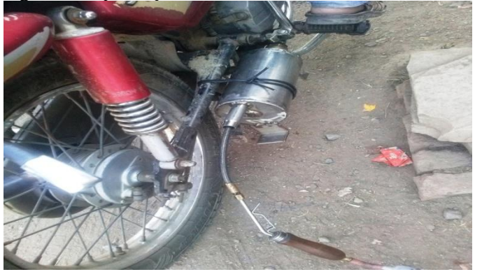
Fig 8:- Set up of Aqua-Silencer

The experimental results obtained were as follows.