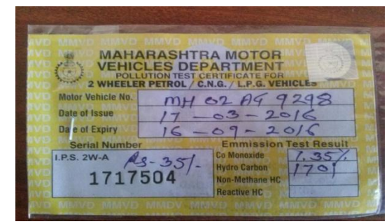
Fig 10:- PUC of Aqua – Silencer