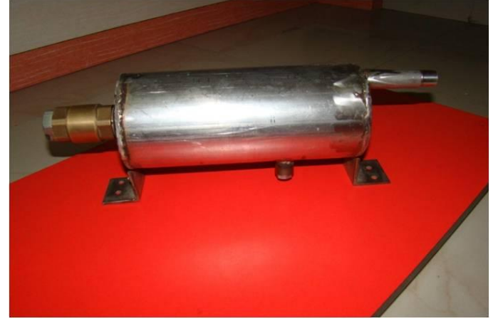
Fig 7 :- Set up of Aqua-silencer

For testing of aqua silencer we used four stroke petrol engine.