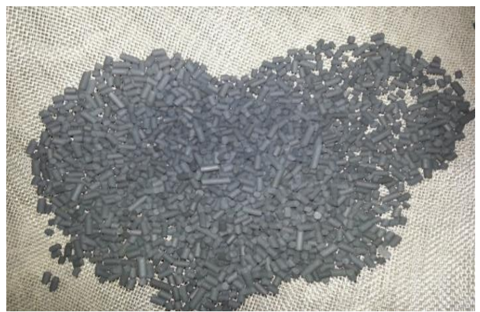
Fig 2:- Activated charcoal pallets.

The charcoal layer is fixed over the perforated tube, these charcoal layer has more absorbing capability because it has more surface area. It is called as ACTIVATED CHARCOAL and it is produced by heating the charcoal