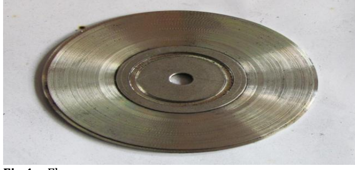
Fig 4: - Flange.

A flange joint is a connection of pipes, where the connecting pipes have flanges by which the parts are bolted together. Here flange is used to link the silencer to the engine.