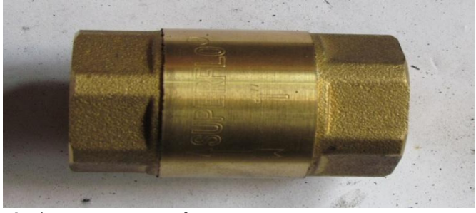
Fig 5: - Non Return Valve.

A non return valve which is a mechanical device , which normally allows fluid (liquid or gas) to pass through it in only one direction. It operates on a spring action. The Aqua silencer is filled with water and it is immediately