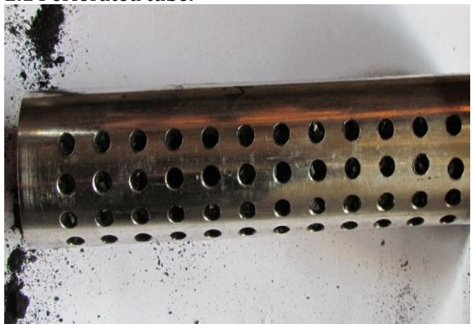
Fig 1:- Perforated tube.

The tube consists of number of holes of different diameters. It is used to transform high mass bubbles to low mass bubbles.