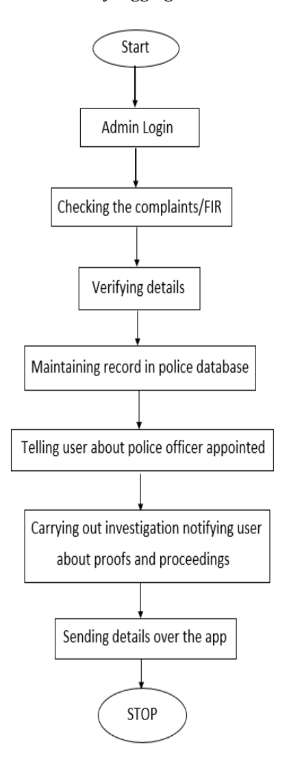
Figure 4.1 Flow graph for the officer

The system allows the common public to register an FIR with the police by using the E-Police System's Android application. The complainant is supposed to create an account to access the application. On creation of account on phone application, the IMEI number of the phone is retrieved by the application and saved into the database. Once the complaint has been registered the police officials are able to see those on their side of the application. Police officers too are required to have a unique account. The cases are assigned to the officers. They can make updations and provide details of the progress on a particular case. These details are available for the complainant on his app which he could check by logging into his account.