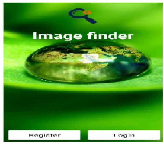
This is the home page of mobile client and Register and Login options are here.