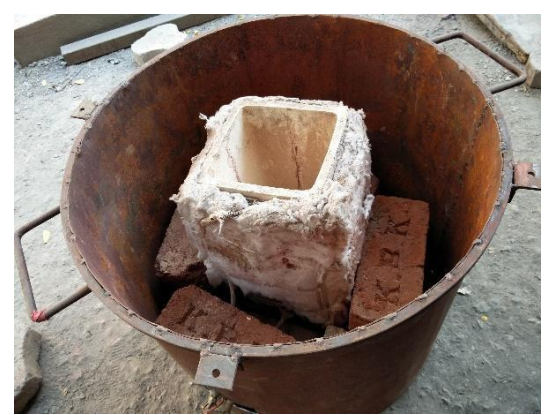
Fig -2: Furnace

The material used for the fabrication of major components is mild steel. Mild steel has a carbon content ranging from 0.15% to 0.30%. It has properties suitable for fabrication and is available easily.