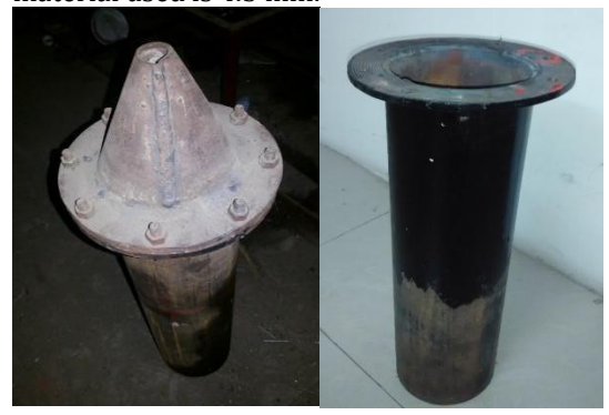
Fig -3: Heating Chamber

The heating chamber is the most important component of the setup as it has to sustain the heat generated by the furnace and also be free of any leakage. The heating chamber basically consists of two main parts, the conical section with a flange and the pipe with a flange. The pipe has an outer diameter of 14 \, \mathrm{cm} and a length of 50 \, \mathrm{cm} . The thickness of the material used is 4.5 \, \mathrm{mm} .