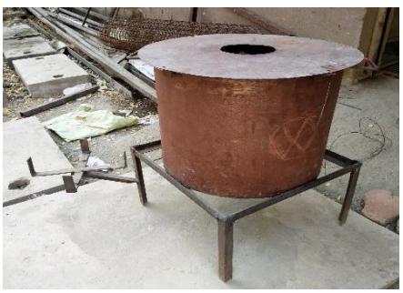
Fig -5: Frame

The circular frame of 52 cm diameter and 42 cm length is prepared by rolling a sheet of metal and welding its ends. The bottom is welded with circular shape metal sheet of 3 mm thickness. The frame houses the furnace and the chamber and also provides thermal insulation.