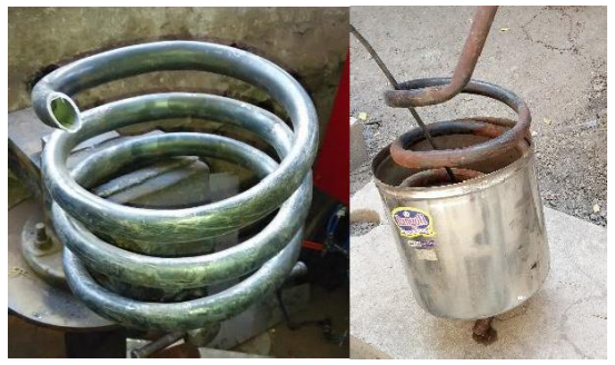
Fig -4: Heat Exchanger

A helical coil heat exchanger consists of a pipe passing through a tank containing water. A standard mild steel pipe of 1 inch diameter and 2.8 m length was bent to fabricate a helical coil pipe using hot working.