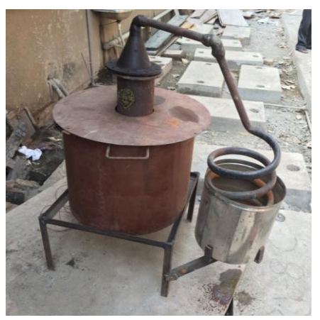
Fig -6: Final setup

Assembly of the setup follows the fabrication and testing of the components required for the process. The stand is placed where the setup is to be installed so as to conduct the experiment. The experiment is performed outdoors for safety. The frame is carefully placed on the stand. The next step involves carefully installing the furnace and the insulation bricks. Then carefully place the furnace in the center. The wires of the electric furnace are sealed in insulating material. Bricks are placed in the rest of the space surrounding the furnace. This ensures minimum heat loss from the furnace in all directions except the top. The frame lid is then used to cover the furnace inside the frame. The lid prevents heat loss. The penultimate step is inserting the heating chamber through the lid into the furnace. The final step of the assembly is placing the helical coil heat exchanger assembly on the stand.