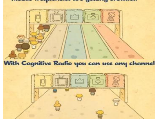
Fig 1-frequency utilization in congnitive radio

Cognitive radio is the new paradigm of designing wireless communication systems which aims to enhance the utilization of radio frequency (RF) spectrum. The motivation behind cognitive radio is the scarcity of available frequency spectrum increasing demand cause by the immerging wireless applications for mobile users. A cognitive radio is an intelligent radio that can be programmed and configure dynamically that monitors & senses its radio environment for potential environment opportunities. iencies are getting crowded