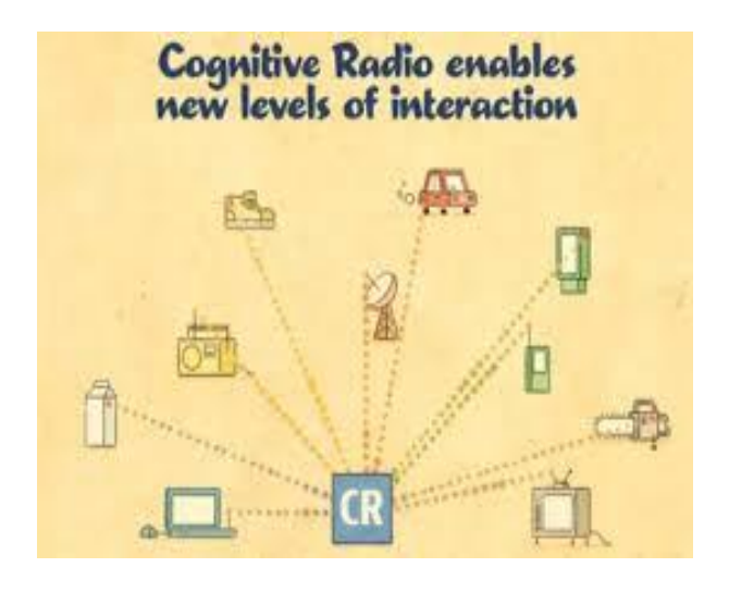
Fig 4 cognitive radio interaction with other frequencies.

This paper presented an overview of basic cognitive radio & its standards. In order to fully utilize the scarce spectrum resources, with a development of cognitive radio (CR) technologies, dynamic spectrum sharing becomes a promising approach to increase the efficiency of spectrum usage. Cognitive radio, which is one of the efforts to utilize the available spectrum more efficiently through spectrum usage has become an exciting & promising concept. herby we increase the efficiency of spectrum utilization. This method is called as dynamic spectrum access(DSA).