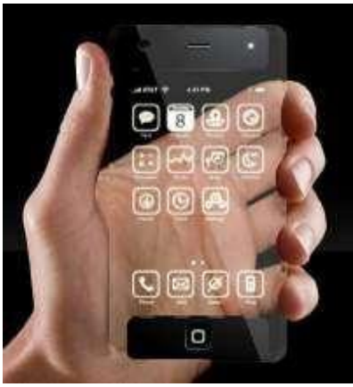
Fig.2: 5G Mobile