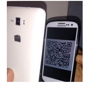
Fig- 4: Data transfer using QR code