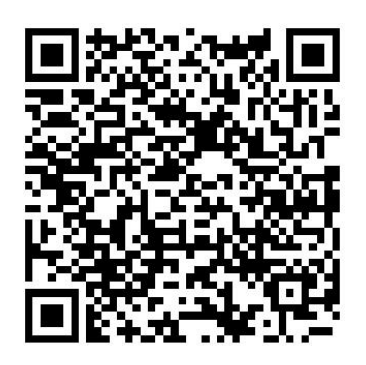
Fig-3: Encrypted Modulated QR code

International Research Journal of Engineering and Technology (IRJET)e-ISSN: 2395 -0056Volume: 03 Issue: 04 | Apr-2016www.irjet.netp-ISSN: 2395-0072