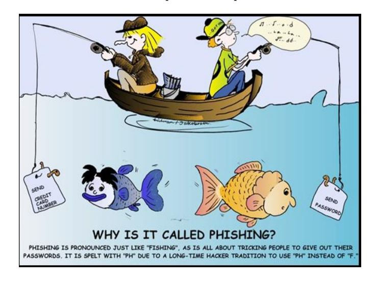
Fig 1. Phishing

There are several different techniques to fight Phishing, including legislation and technology created purposely to protect against Phishing. No single technology will fully stop Phishing. However a combination of good organization and practice, proper function of current technologies and improvements in safety of technology has the potential to severely reduce the prevalence of Phishing and the losses suffered through it. Anti-Phishing software and computer programs are designed to reduce the occurrence of Phishing and trespassing on private information. Anti-Phishing software is designed to track websites and observe activity; any doubtful behavior can be automatically reported and even reviewed as a report after a period of time.