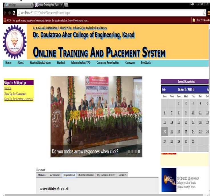
Figure 2. Homepage

The Homepage is as shown in Figure 2 on which right side it contains Events and News are displaying. Left side of homepage contains links of signing up for Admin/TPO, Company and Student. The Menu bar contains Home, About, Student Registration etc options.