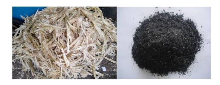
Figure 2 – Sugarcane Bassage And Sugarcanebassage Ash