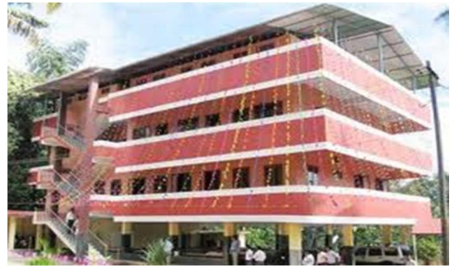
Fig (a) show open ground storey building

Open ground storey (also known as soft storey) buildings are commonly used in the urban environment nowadays since they provide parking area which is most required. This type of building shows comparatively a higher tendency to collapse during earthquake because of the soft storey effect. Large lateral displacements get induced at the first floor level of such buildings yielding large curvatures in the ground storey columns. The bending moments and shear forces in these columns are also magnified accordingly as compared to a bare frame building (without a soft storey). The energy developed during earthquake loading is dissipated by the vertical resisting elements of the ground storey resulting the occurrence of plastic deformations which transforms the ground storey into a mechanism, in which the collapse is unavoidable. The construction of open ground storey is very dangerous if not designed suitably and with proper care. This paper is an attempt towards the study of the comparative performance evaluation of three OGS building case studies.