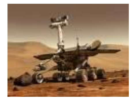
NASA Mars Rover

These types of robots can collect the specimens and it has been automated on board lab for testing specimens directly from the space. These robots can travel to other planets and take measurements accurately .