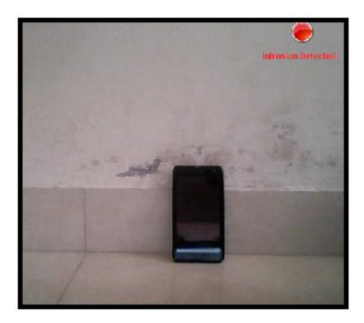
Fig. 3 Image of an object set for intrusion