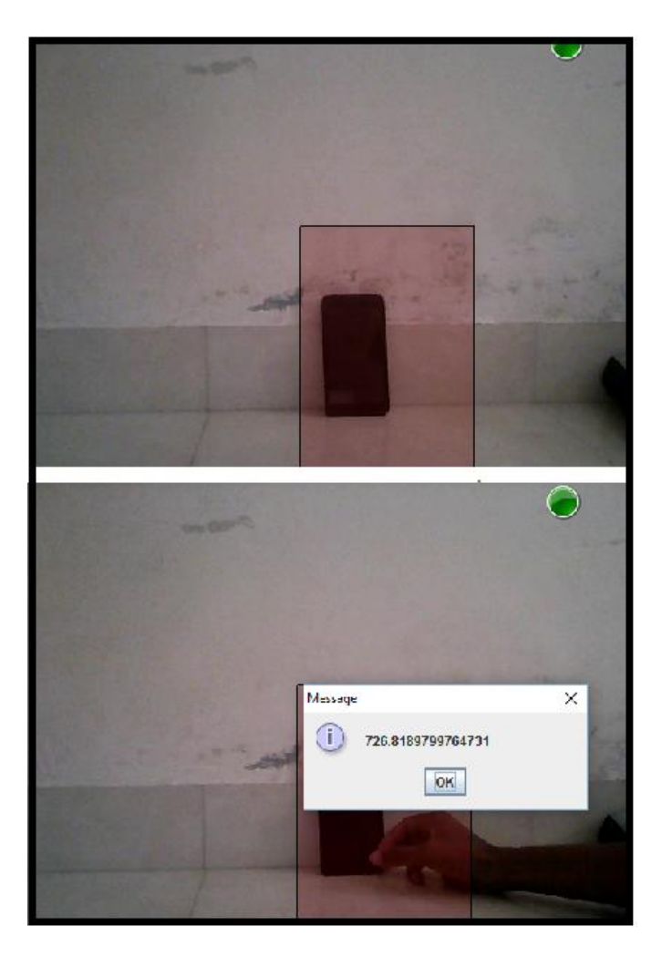
Fig. 4 Image showing intrusion

International Research Journal of Engineering and Technology (IRJET)e-ISSN: 2395 -0056Volume: 03 Issue: 04 | Apr-2016www.irjet.netp-ISSN: 2395-0072