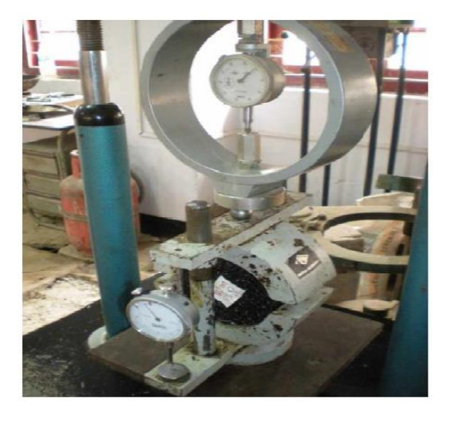
Figure-1: Marshall Test in progress

smaller uniform pieces. This ensures the uniform size of the polythene in the bitumen mix. Mixing should be proper while adding the polythene to bitumen and aggregates. The specific gravity of polythene was found 0.90