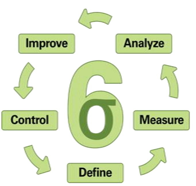
Figure 1: Showing Six-Sigma methodology:

Control: Last step in the DMAIC methodology, control makes sure that any unwarranted variances stand out and are taken care of before they influence a process negatively and cause defects. Controls may be in the form of pilot runs to ensure that the processes are capable. A corrected and improved process can transition into standard production guidelines. However, continued analysis and measurement must follow to keep ensure that the processes is on track and free of defects with-in the Six Sigma limit.