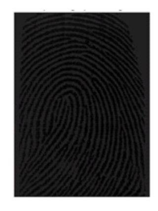
Fig.No.2: Input Fingerprint

The fingerprint detection can be done by applying the distorted fingerprint image. The orientation map and period map can be viewed as two classification problem. The applied input can be taken as the orientation map and period map which is shown in Fig.No.2, 3 and 4. These two maps are needed to the feature vector and then the Naive Bayes classifier is applied to perform the classification task.