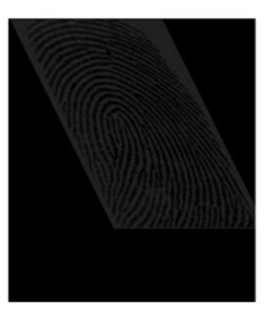
Fig.No.5: Geometric Transformation of the Distorted Field

The registered image after the classification stage is applied to estimate the field of the distorted fingerprints. The geometric transformation of the distorted fingerprints is shown in the Fig.No.5.