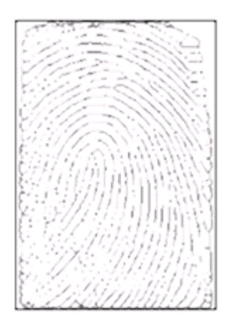
Fig.No.4: Period Map of the