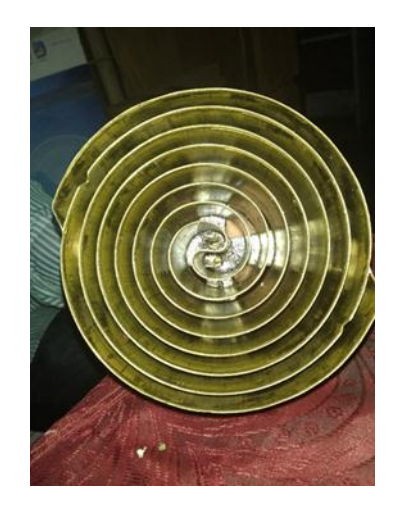
Fig -3: Coil Mold Cavity

Therefore bending stress generated due to total load is smaller than permissible, so design is safe.