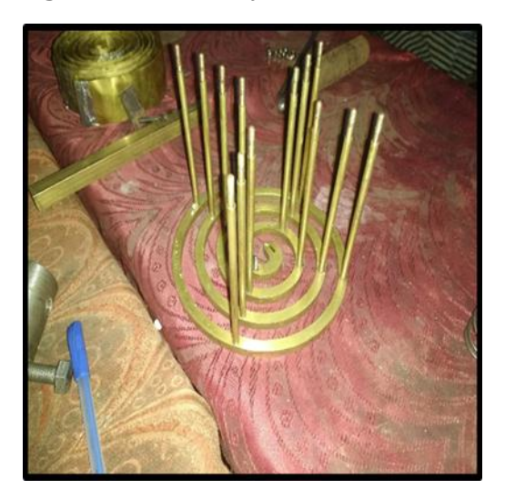
Fig -4: Coil Ejecting Plate