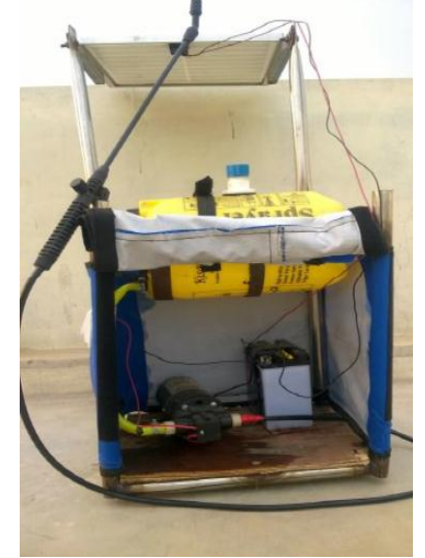
1.5 Agro sprayer