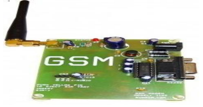
Fig 3.2 GSM Modem

When a GSM modem[3][4] is connected to a computer, this allows the computer to use the GSM modem[3][4] to communicate over the mobile network. While these GSM modems are most frequently used to provide mobile internet connectivity, many of them can also be used for sending and receiving SMS and MMS messages.