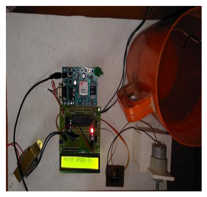
Fig 4.1 Project Overview

This signal is sent to the microcontroller which decodes the signal and performs the corresponding action for the respected output. At the same time Microcontroller sends the signals to LCD monitor which displays the set speed and direction of DC motor. Here we have used 16 \times 2 LCD which has 16 bit length and 8 bit characters. We have used L293D driver for voltage amplification and H-Bridge circuit. Depending up on the outputs of the microcontroller, speed & direction of rotation of a motor can be rotated and we can also fill up a water tank from the motor speed. This avoids from wastage of power by the motor and taking advantage of filling up a water tank, as water is more precious for human resources.