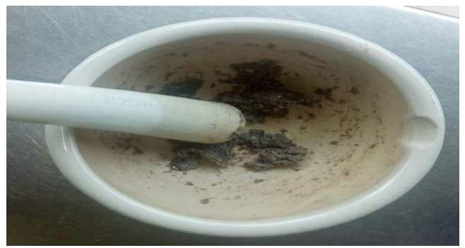
Plate 2: Preparation of the inert diet in a mortar.

particle size fishmeal. In the preparation of inert diet, raw eggs were boiled for about 10 minutes after which the egg white was separated from the yolk. The egg white was then crushed to a very fine particle and then mixed with the fishmeal earlier prepared to serve as a binder (see Plate 2).