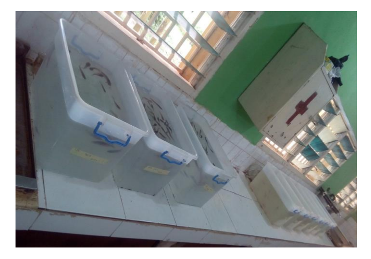
Plate 1; fish culture facility and layout of experiment

This study was conducted in the main laboratory of Faculty of Agriculture, University of Benin, Benin-city, Edo state, Nigeria, for forty-two (42) days. Clarias gariepinus larval were obtained through the hypophysation technique. On the fourth day after hatching, 720 healthy larvae were randomly selected from the hatchery and distributed into nine preprepared transparent plastic tanks holding 40L of water (see Plate 1) at a density of 80 larval per tank under natural photoperiod regime. At the onset of the experiments, the average initial weight of fish was taken per tank as follows: Diet 1, 0.0084g; Diet 2, (0.0067g); Diet 3, (0.0084g).