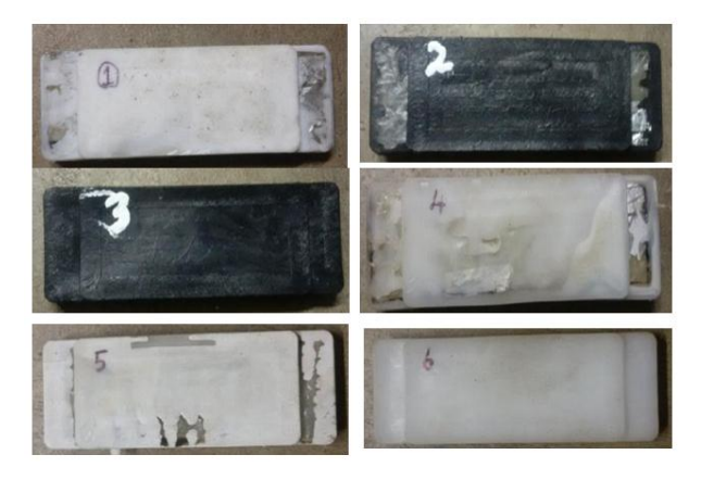
Fig -3: Sample

Fig -2 : Fiber inserts, 2. Fiber inserts in Die, 3. Injection Moulding Process and 4. Solidification