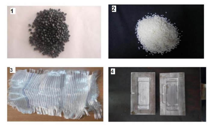
Fig -1 : High-density polyethylene (HDPE), 2. Polypropylene (PP), 3. Glass Fiber, 4. Die-sets

As the plastic granules cannot be degraded, recycling procedure is in use for preparing the new materials. Since plastics are prepared from the petroleum, the plastics cannot be burned to recycled. High-density polyethylene (HDPE) or polyethylene high-density (PEHD) is a polyethylene thermoplastic made from petroleum. The figure 3.1 presents the typical recycled polymers and die-set.