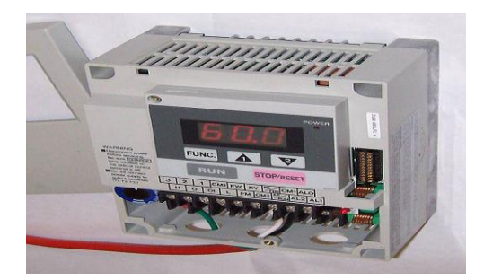
Fig -1: Varible Frequency Drive

The Variable Frequency Drive (VFD) are also one of the technique which can be used for controlling the speed of Electrical Machines or Electrical Generator. In this method for controlling the speed of Electrical Machines or Electrical Generator the Power Electronic Device are used. The Power Electronic Device are used to vary the frequency of Input Power to the motor and theirfore controlling the speed of Electrical Machines.