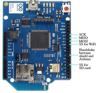
Fig -4: ARDUINO WI-FI SHIELD