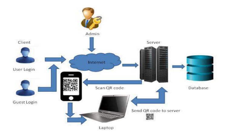
Fig -3.1 : System architecture of bus pass system using web server.

There are two types of barcodes: one dimensional (1D) barcodes and two dimensional (2D) barcodes. Quick Response code (QR code) is a popular 2D barcode. All major Smartphone platforms support QR code scanning either natively or through third-party applications. As camerabased communications are short-range, highly directional, fully observational, and immune to electromagnetic interference, they have been applied to security applications. There are four main modules in project are as follows: