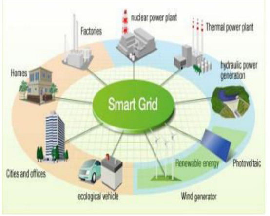
Figure 3: Smart Grid

4) Smart City: Fog computing would be able to obtain sensor data on all levels of activities of cities and integrate all the mutually independent network entities within. The applications of this scenario are facilitated by wireless sensors deployed to measure temperature, humidity, or levels of various gases in the building atmosphere. In this case, information can be exchanged among all sensors in a floor, and their readings can be combined to form reliable measurements. Sensors will use distributed