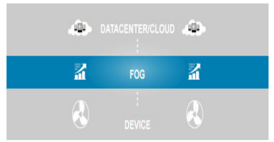
Figure 1: The fog extends the cloud closer to the devices producing data