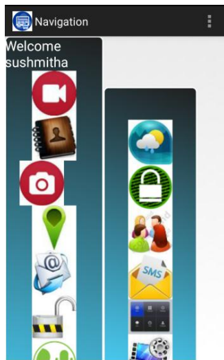
Figure 1: Selection of services

dynamically alter their requirements, even after the final application development. The initial end user application involves the options such as available combinations (available services), check combinations, scanQR (to download the integrated services as a single application), logout. Nearly 80 possible combinations are available. The following figure 1 shows the selection of the services by the mobile end user.