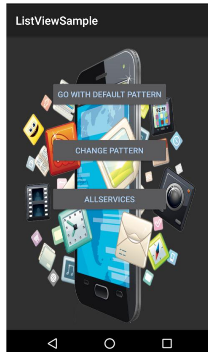
Figure 3: Deployment of Micro-App

The generated apk file is stored either in the cloud where the ant build tool is deployed or on the server database. When the user is required with the final application, they can download the final Micro-App from their initial application where they gave the request for the integration of services. To download the Micro-App the user can visit the web end and sign-in as user using mail id and password. There, the user requested applications are listed along with the Qrcode. The Qrcode contains the path where the Micro-App is stored. It may be either the server database or the cloud space. By scanning the Qrcode the user can download the application and deploy it. The following figure 3 shows the deployment of the Micro-App (integrated application services) by the mobile end users