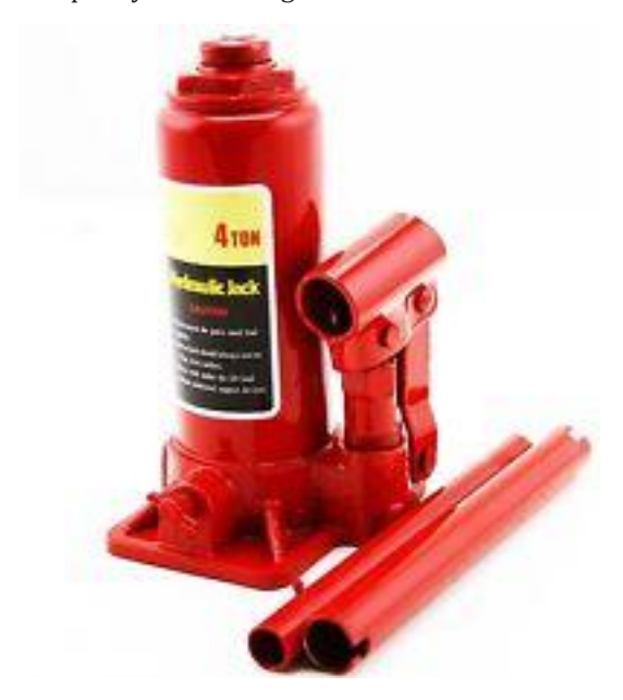
Fig -3: Hydraulic jack

A hydraulic jack is a mechanical device used as a lifting device to lift heavy load or more force. Hydraulic jack get their power from pressurized hydraulic fluid which is typically oil. Hydraulic jack is placed on slider and for better operation the base of the hydraulic jack is welded. Hydraulic jack capacity is 10000 kg.