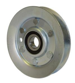
Fig -4: Pulley

Pulley is a wheel on axle or shaft designed to support movement. Top c-channel having holes for changing position pulley as per requirement. pulley diameter is 15 cm.