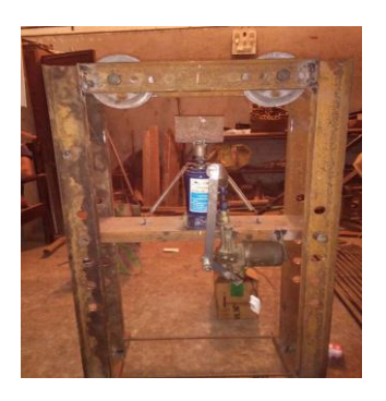
Fig -2: Constructional Diagram Components in Hydraulic Ladder:-