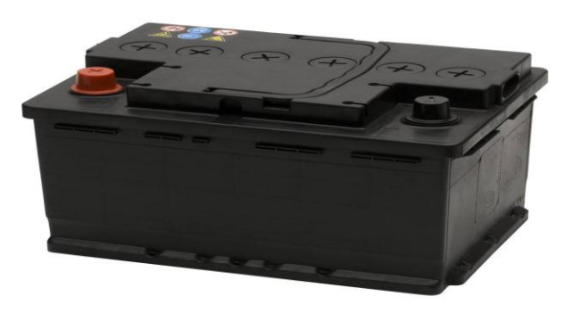
Fig -6: battery

and battery has given supply of electric power. hence battery is used in 12 volt