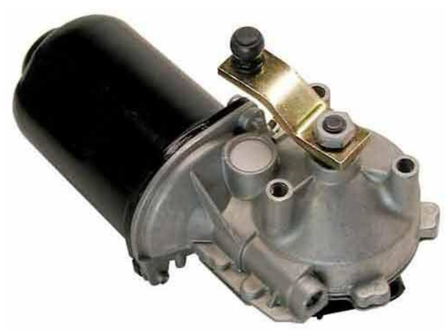
Fig -5: Wiper Motor

A wiper motor is device.it is consist of a metal arm, pivoting at one end. Wiper motor is welded lower side of slider and it gives the uniform linear motion on lever. generally wiper motor used in 150rpm.