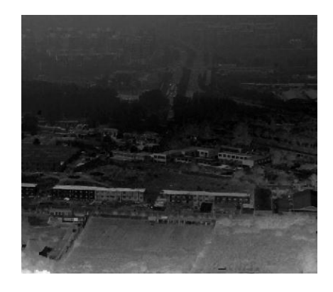
FIG-3 Air light estimation