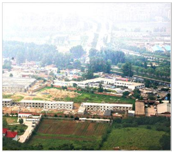
Fig -4 Haze Removal Image

Fig 2, Fig-3 and Fig -4 shows that original image, air light estimation and haze removal image after processing of iteration process to get efficient haze removal image.