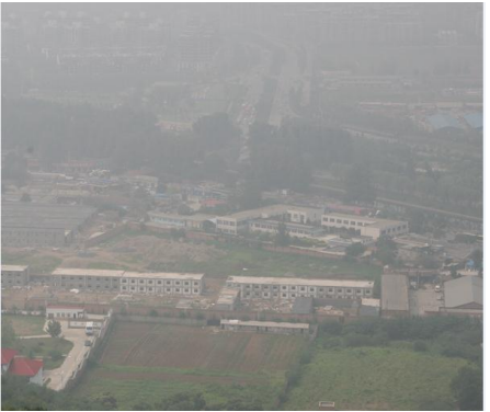
FIG-2 original image