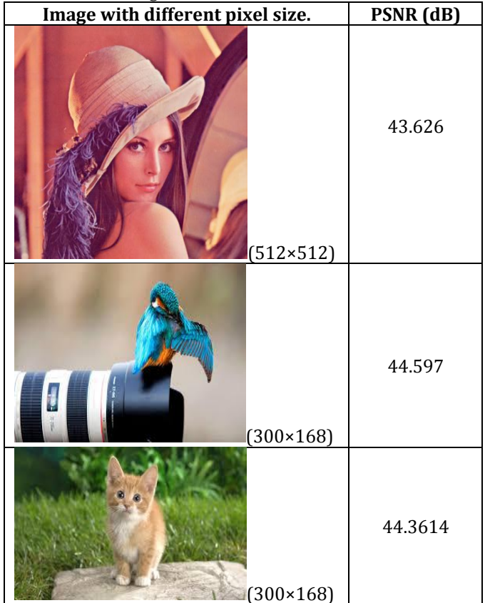
Table-1 Images with different PSNR values

In this section, we demonstrate the effectiveness of our proposed methodology. The simulation is done on MATLAB2012a & analysis of PSNR and robustness of image. This method is applied to several images having different types of pixels. The first figure in Table-1 is a 512X512 image which is encrypted and embedded using 128 bytes of plain text and 128 bytes of original image in our experiment. In [1], the PSNR value for the same image is 34.1 dB. In our proposed method, the achieved PSNR value 43.626 dB. At the receiver side, data is extracted not with data loss. Other than this, PSNR values are calculated using different images having various pixel size and is listed below.