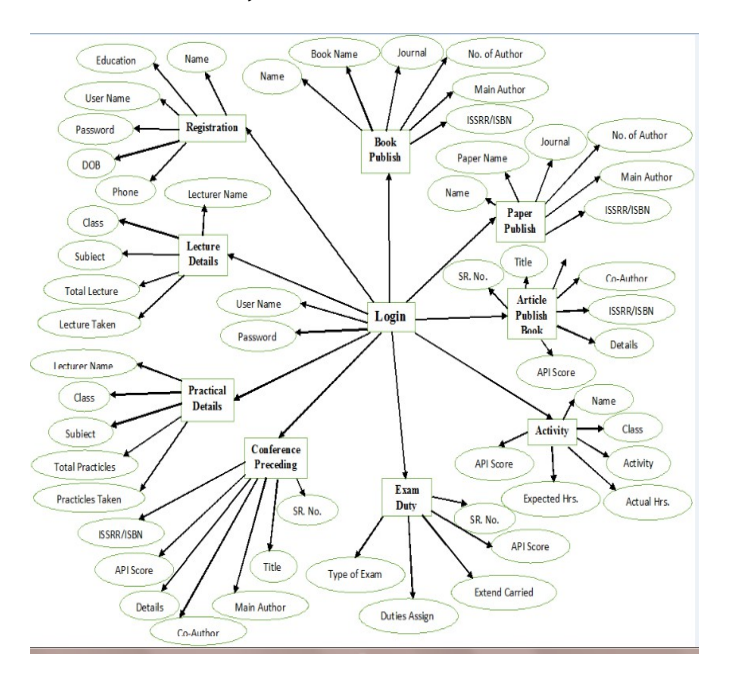
Fig -1: System Skeleton

Structure of data entry modules: A performance appraisal is a systematic and periodic process that assesses an individual Teachers job performance and productivity in relation to certain pre-established criteria and universities objectives.