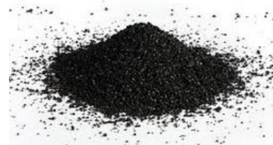
Fig-1: Copper slag

Copper slag (CS) is a waste product which comes out from the smelting of copper. The process of extracting copper slag varies according to the type of ore and the purity of the final product. The unwanted materials are physically or chemically removed to get proper concentration of slag. Copper ore is mixed with powdered coke and sand which is heated at a high temperature in blast furnace. The furnace consists of steel plates lined inside with fire clay bricks. Hot air is introduced from the tuyers near the base of the furnace. The upper layer consists of slag and is removed while the lower layer is called matte which is a mixture of cuprous sulphide and unchanged ferrous sulphide [1].