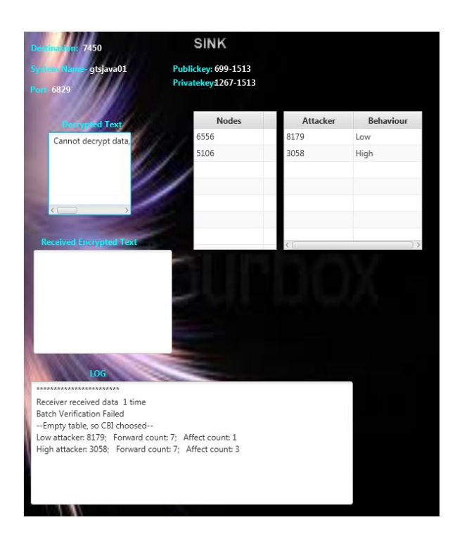
Figure 4.3-Finding the corrupted packet