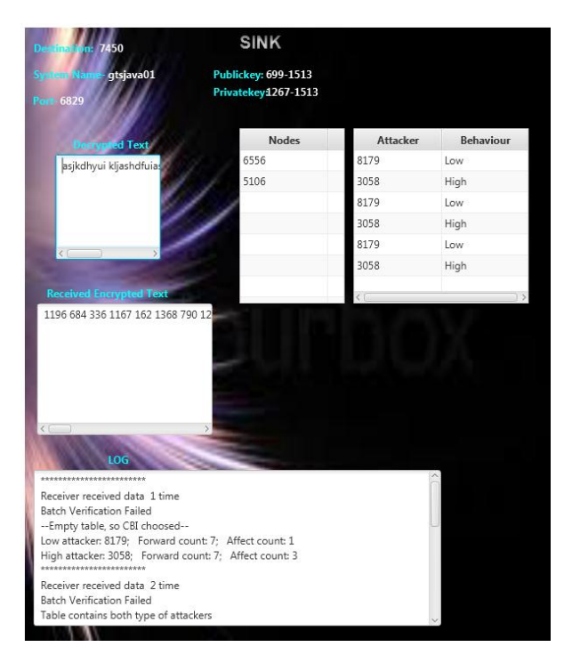
Figure 4.4-Receiver intimate to the normal users about the attackers.