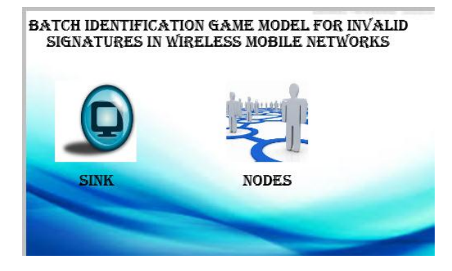
Figure 4.1 –Node formation