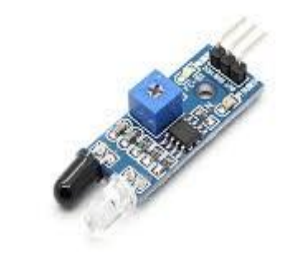
Fig -1: IR Sensor [6]

Resistance is very low. The operating voltage of IR Receiver is also 2 to 3V.