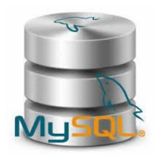
Fig -4: MySQL Database [6]

We are going to use MySQL database. Here the count of vehicle and its timer this all things present in database as log. So at the end of data if we want to check total vehicles or traffic on street with the help of these logs we can check data from database. And suppose we want to provide that data to user using android app then with the help of this data user can see the traffic of signal.