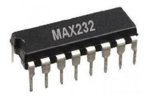
Fig -5: MAX-232 [6]

The MAX-232 IC is an integrated circuit which consists of 16 pins and it is a resourceful IC mostly used in the voltage level signal problems. Generally, the MAX-232 IC is used in the RS232 communication system for the conversion of voltage levels on TTL devices that are interfaced with the PC serial port and the Microcontroller. This IC is used as a hardware layer converter like to communicate two systems simultaneously. The image of MAX232 is shown below.