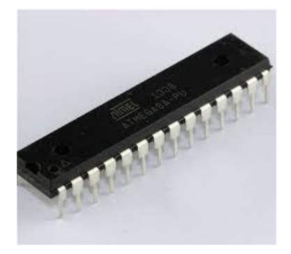
Fig -3 : atmega8 [6]

Here we are going to use atmega8 microcontroller. There many microcontroller families like ARM, AVR, etc. This atmega8 is belongs to AVR microcontroller family. Here atmega8 takes the input from ADC which is in the form of digital.