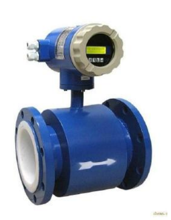
Fig. 3 Flow Transmitter