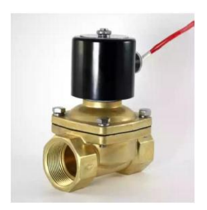
Fig.2 Solenoid valve