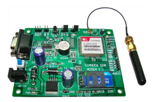
Fig -4: GSM module

After the comparison takes place the differed image is obtained from the result of comparison. The comparison is to compare the background image from the foreground image. And then the differed image is obtained means, it is stimulated to send an alert. The alert system uses the GSM module to send the image and an alert to the admin.