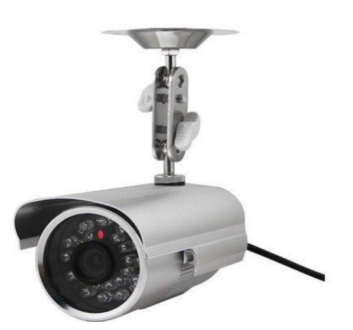
Fig-2: CCTV camera

In this the web camera is started to surveillance the location. Afterwards the camera started surveillance and extracting the differed image by assuming bit rates. The image which is differed is captured and stored in the local database called client database. The camera must be