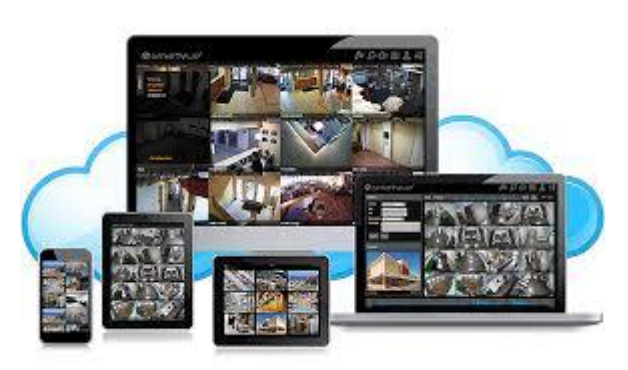
Fig -3.client system

And if there is a change in the bit rate means it captures the image and then send it to the local database. The obtained image, which is detected as different image in a bit rate assumption.