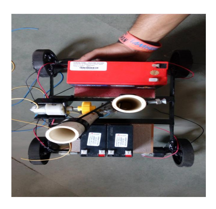
FIGURE 2- Fabricated model of the wireless lawn mower

Fig. 1 shows the model designed in Catia v5 software and fig. 2 shows the actual fabricated model of the wireless lawn mower.