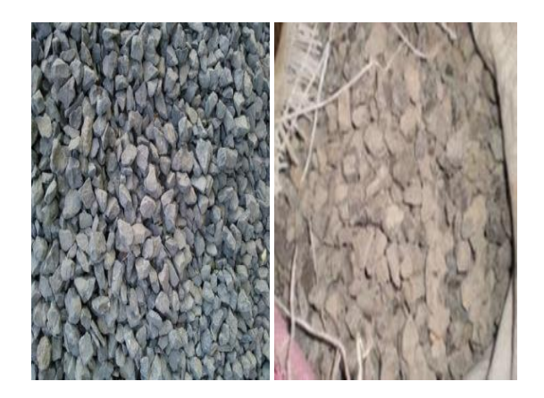
Recycled Aggregate and Natural Aggregate

i. Coarse Aggregate (Recycled and Natural Coarse Aggregates) : In this experiment, the coarse aggregates used are natural and recycled coarse aggregates. The fractions from 20 mm are used as a coarse aggregate. The Coarse Aggregates fromcrushed Basalt rock, conforming to IS: 383 is beingused. The Flakiness and Elongation Index weremaintained well below 15%.