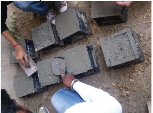
d. RESULTS AND DISCUSSION

Concrete contains cement, water, fine aggregate, coarse aggregate (Recycled and Natural). With the control concrete, i.e. 100% of the natural fine aggregate is replaced with the artificial fine aggregates, 40% of the natural coarse aggregate is replaced with recycled coarse aggregates and 60% of cement is replaced with supplementary the cementitious material i.e. fly ash . Three cube samples were cast in the mould of size 150x150x150 mm for each 1:1.03:2.5 concrete mix with partial replacement ofcoarse aggregate and 100% replacement of natural fine aggregates with a w/c ratio as 0.50 were also cast. After about 24 h the specimens were de-moulded and water curing was continued till the respective specimens were tested after 7,14 and 28 days for compressive strength and workability tests.